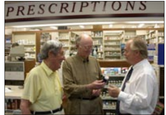
Quality healthcare should be affordable and accessible for each of our citizens.

With the broad experience of being a spouse of a dedicated physician, as architect and community campaign chairman for the Haywood Regional Medical Center's Health and Fitness Center, and as a Hospital Foundation board member, I am deeply committed to health, health care, and the healthcare economy — all critical aspects for a brighter future here in the mountains.